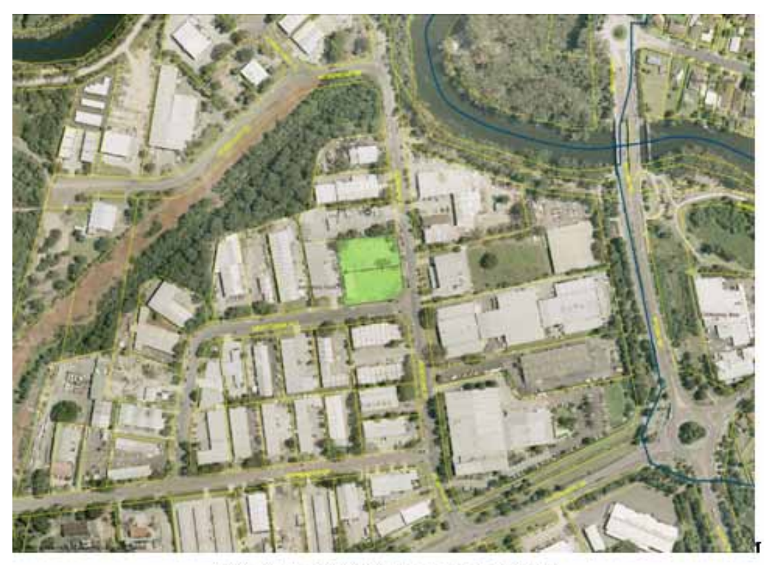
Figure 1: LEP Amendment Request Location Plan1

This LEP Amendment request seeks to introduce an enabling clause to permit 'plant hire establishment' activities within Lots 9 and 10 DP 255990, 15 and 13 Hereford Street, Berkeley Vale.